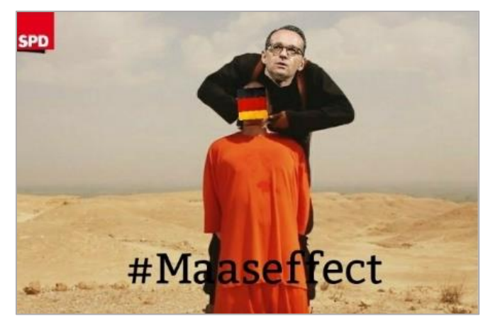
Provocative memes: Segment from an Islamist execution video as an anti-democratic photo collage serves as input into debates.

Specifically Twitter – not least because of the character limit for Tweets – is a platform for disseminating images and memes typical for the extremist scene as condensed content. Here, graphic depictions of internet culture like the comic character 'Pepe the Frog' as well as popular films and series serve as a basis; but also contemporary iconography is modified for disseminating the Identitarians' own propaganda.