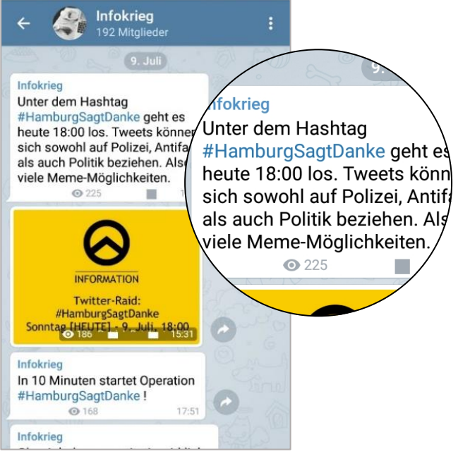
Call for 'trending raids' via messenger app: Seemingly innocuous hashtags shall ensure a vast reach of right-wing extremist content.

In July, the movement started such a virtual flash mob with the hashtag #Maaseffect as a right-wing extremist protest campaign against the 'Act to Improve Enforcement of the Law in Social Networks', initiated by the Federal Minister of Justice Heiko Maas. Although this action failed to become a 'trend', close to 2,900 Tweets were posted within a short time. Analysis has shown that 577 Twitter accounts were involved in the action and that most of the Tweets (nearly 70 %) were posted from only 58 profiles. Still, this small action reached 763,500 users.